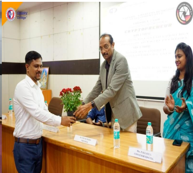
Bengaluru, Karnataka, India CA 17, 36th Cross Rd, 4th T Block East, Jayanagara 9th Block, Jayanagar, Bengaluru, Karnataka 560041, India Lat 12.922541° Long 77.592917° 13/07/22 04:23 PM