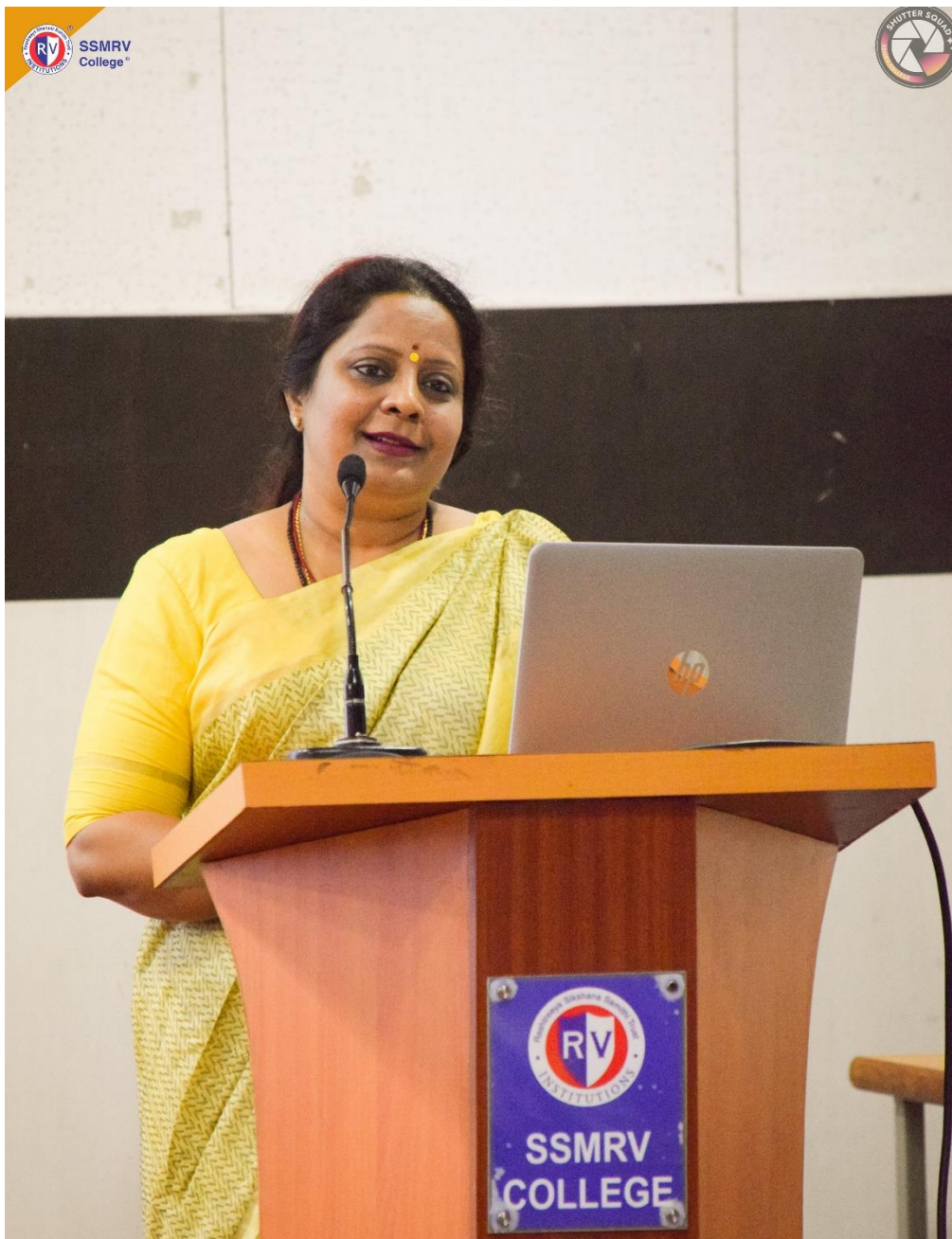
Interactive sessions with the Chief Guest for the Corporate Connect