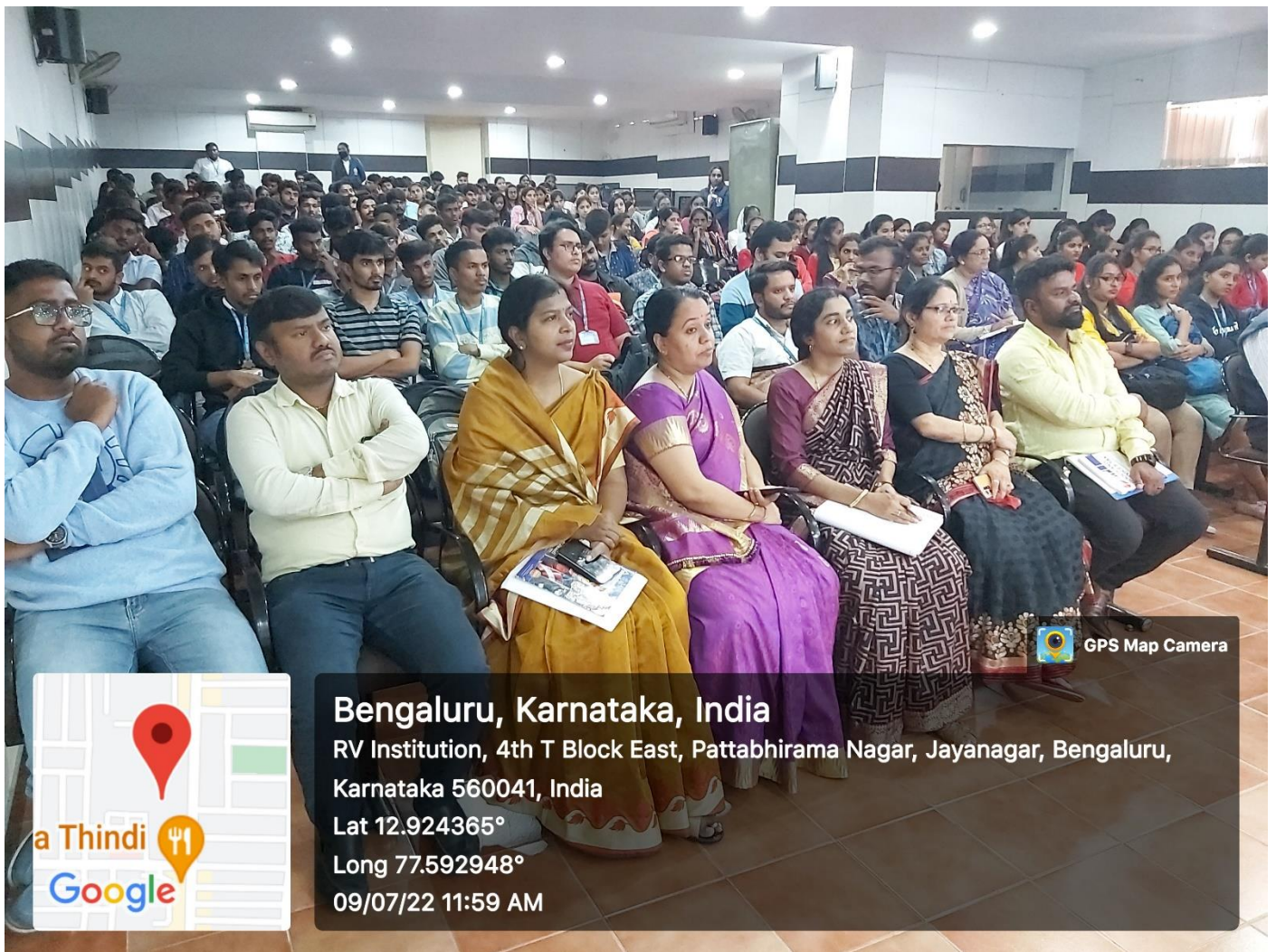
Department of Commerce staff with the Final year B com students