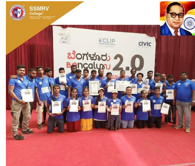
Dr.B.R.Ambedkar Study and Research Centre & Dr.APJ Abdul Kalam Association members