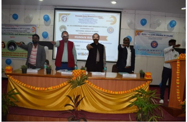
Guest lecture on the