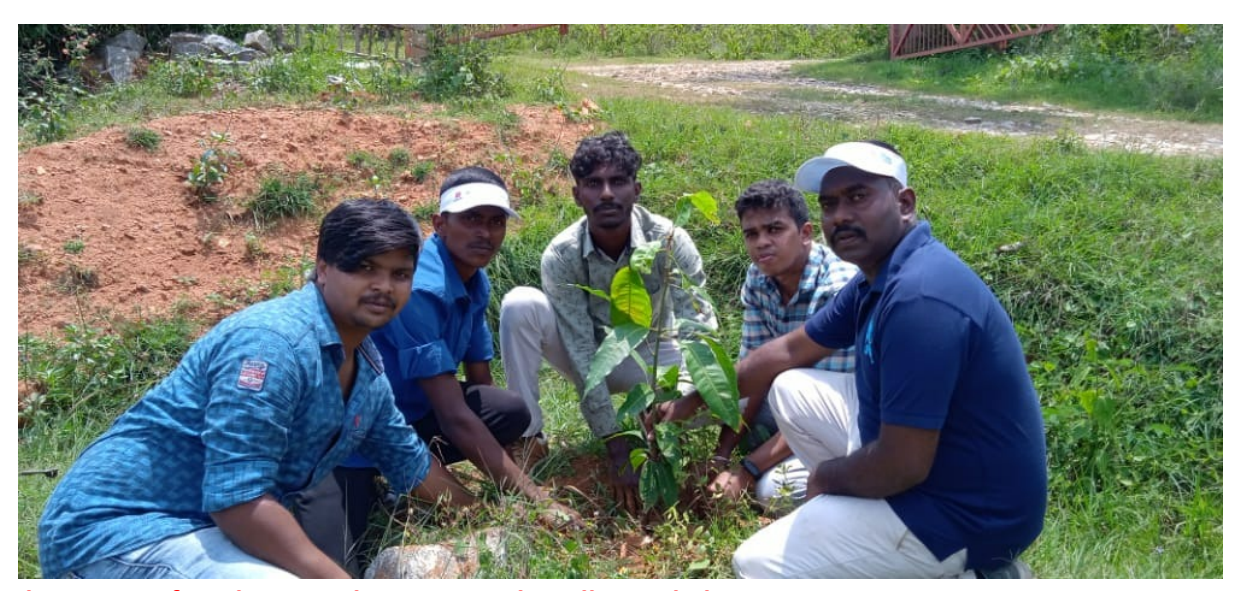
Plantation of Saplings at Thammanayakanalli, Anekal.

ASRC club In association with Kiwaunee India Pvt Ltd had organised a Plantation